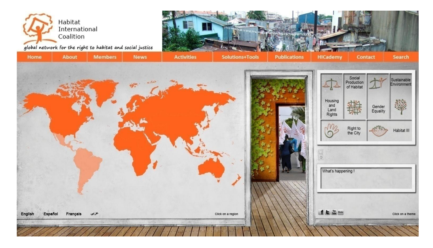
New HIC Portal (www.hic-net.org)

year started with a very active participation in and around WUF7 in Medellín. HIC was not only attending the official event, but also organized other activities with local organizations. The GS also coordinated the strategy for Prep Com 1 in New York and participated in the international Working Group on Habitat III together with other Networks and Partners supporting the participation of HIC representatives in the above mentioned event. Communication played an important role in these activities; thanks to the coordination of the Working Group on Visibility, various press releases and documents were launched and distributed, disseminating HIC's position. In relation with the Right to the City For All project, the Secretariat has been deeply involved in the preparation of the international event on the Right to the City and in redacting the documents that emerged from this activity